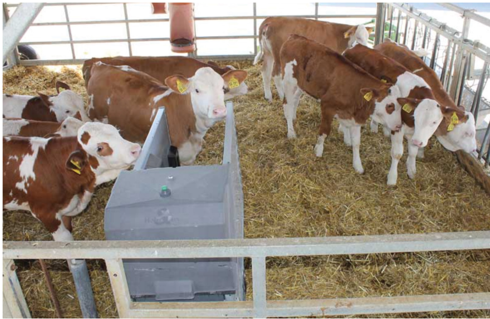
Feeding stalls may be single units or pairs fixed side by side.

Seven systems were found during research for this article. In addition, Calf Smart feeders made by Zeddy in Palmerston North are undergoing a review and will