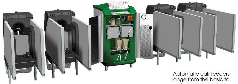
Automatic calf feeders range from the basic to quite complex systems.

Rear a more even line of better, quieter calves; and quicker. These are claims made by advocates including users, though may draw on comparisons with a manual system that was inefficient and problematic. Better means heavier and healthier; quieter because there is less bullying and speed drinking; and "quicker" means reaching weaning weights earlier. The key to this is that an allocated ration of milk is fed little and often so every calf has the chance to get its daily allocation. The quick drinkers do not get more than